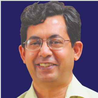
Former Executive Chariman, (NABARD)